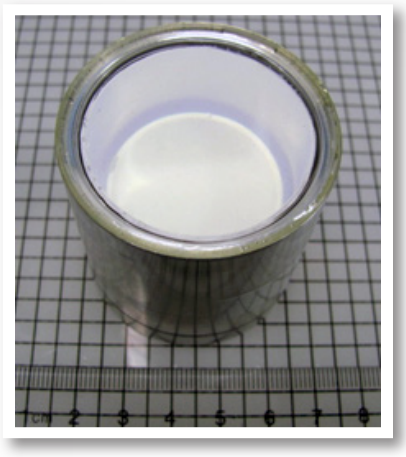
1.5" x 1.5" Srl, Crystal